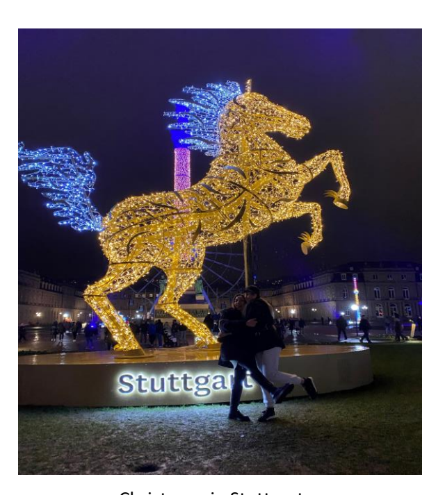
Christmas in Stuttgart