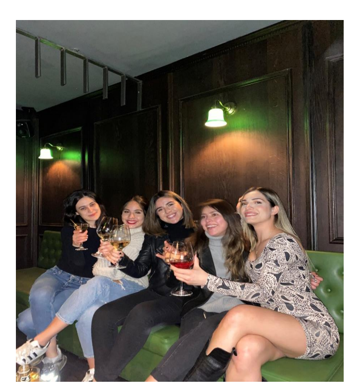
Jigger&Spoon (in Stuttgart)