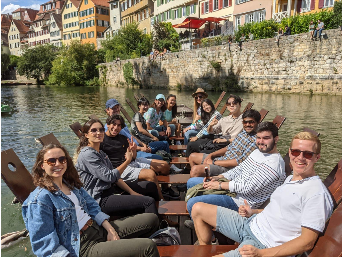
Day trip to Tübingen

After that, we had our time to adapt to the city and with that, the intensive German course began. They were three intense weeks, with classes of 3h per day. I have to say that it had been really effective because I learned the language a lot. We also started with university classes. At the beginning, when they gave me the timetable, I was very surprised, because I am used to having the same timetable every week. I'm usually 5-6 hours each day in my home university with classes of 1 hour for each course. On the other hand, at DHBW, we have had classes all day (7-8 hours), of the same subject and even all the week with the same subject. But it was very good, due to the fact that you spent more hours at the university but you could go home without loads of homework.