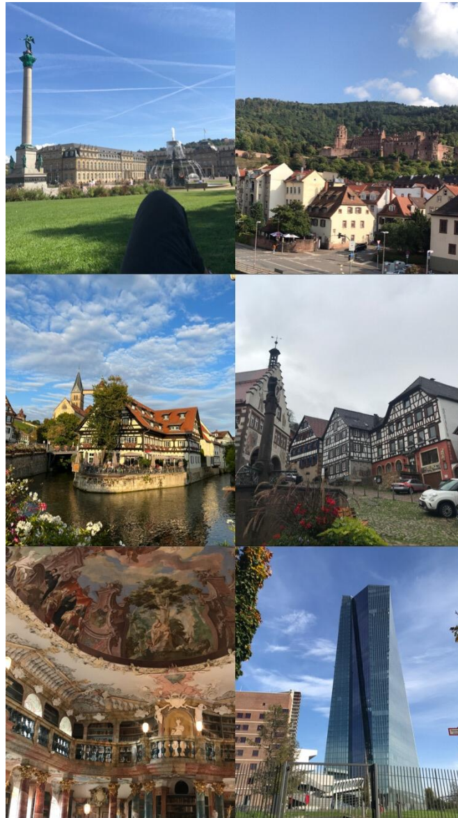
Stuttgart, Heidelberg, Esslingen, Schiltach, Ulm and Frankfurt.

My main goal at this stage was to travel and get to know new cities and countries. I have achieved it and I am very grateful for this opportunity. I think I have learned a lot from every place and especially from Stuttgart.